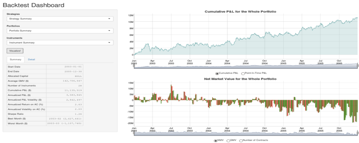
Figure 1: The backtestGraphics interface for the commodity data frame. The interface houses three dropdown menus on the top-left to toggle between Strategies, Portfolios, and Instruments. The user may click on the “Visualize” button to look at the summary statistics and the interactive plots. Finally, the user can also switch between plots with the radio buttons at the bottom of the plots.

Now, let us individually examine the various components of the Shiny interface: