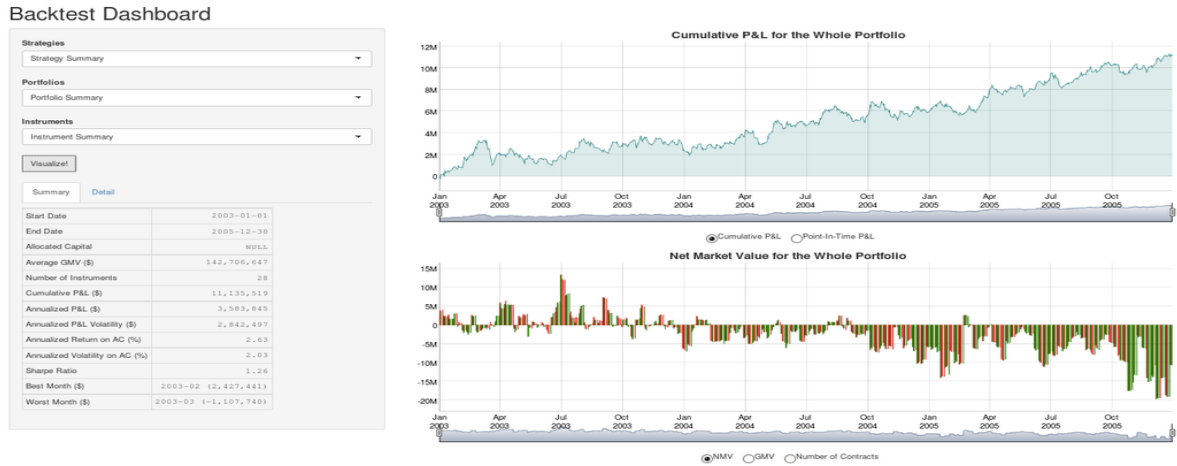
Figure 1: The backtestGraphics interface for the commodity data frame. The interface houses three dropdown menus on the top-left to toggle between Strategies, Portfolios, and Instruments. The user may click on the “Vizualize” button to look at the summary statistics and the interactive plots. Finally, the user can also switch between plots with the radio buttons at the bottom of the plots.

Now, let us individually examine the various components of the Shiny interface: